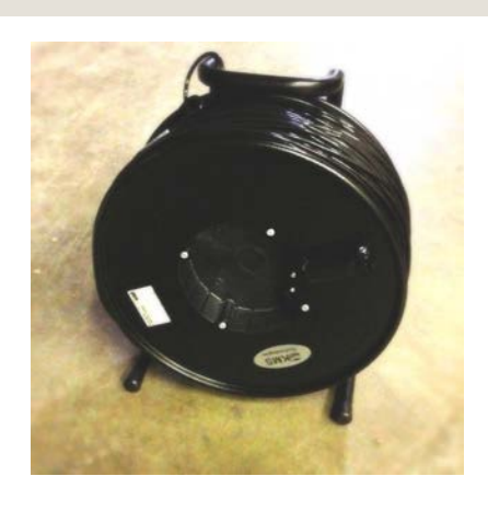
KMS-115 electrode extension cable (on the reel)

The KMS-115 electrode extension cable is used to provide connection from KMS-820 acquisition unit (the electrode transition cable) to electrode for electrical field measurement. The standard cable lengths of the cable are 50 and 75 meters. Other lengths are available upon request.